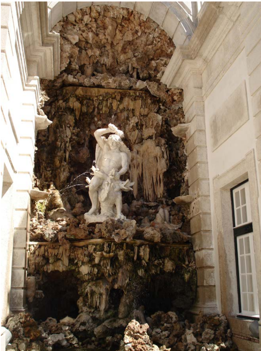
Viveiro dos Pássaros cascade, Gardens of Belém Palace, Lisbon

The Italian origin of the sculptures was traditionally spoken of and it was confirmed in the case of Hercules' statues when restoration and cleaning campaigns allowed identification of the signature in the base: IOSEPH GAGINUS SCULPIT . However, the interpretation of this signature caused some confusion that I will clarify.