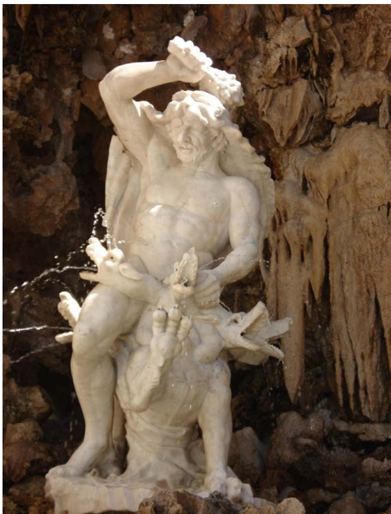
Hercules, Giuseppe Gaggini, Viveiro dos Pássaros cascade, Gardens of Belém Palace, Lisbon